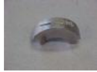
Old Style Plate

We can do signature plates for any purpose. We can get old style plates as well as new style plates. Give us a call today to get your quote for your personalized signature plate.