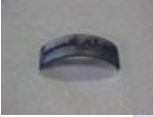
New Style Plate